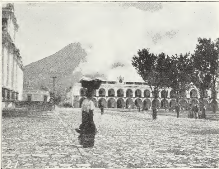
Antigua, Guatemala. Cathedral, Volcans de Agua, Government Palace.

I left Puerto Barrios on the International Railroad and traveled through many miles of banana farms. The United Fruit Company has about forty thousand acres of bananas in that district and is planting about 10,000 acres more each year. Up we climbed from the low, hot coast through valleys and narrow river beds, through tunnels and over bridges until we passed over the divide at an elevation of more than five thousand feet. Then I could look down upon the beautiful city of Guatemala. Guatemala City is the Capital